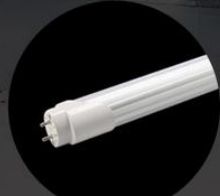
LED Tube Light